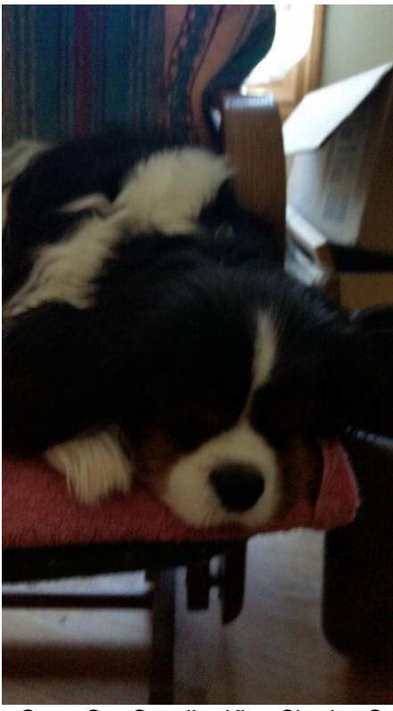
Carey Grant Our Cavalier King Charles Spaniel relaxing. The dog days of summer