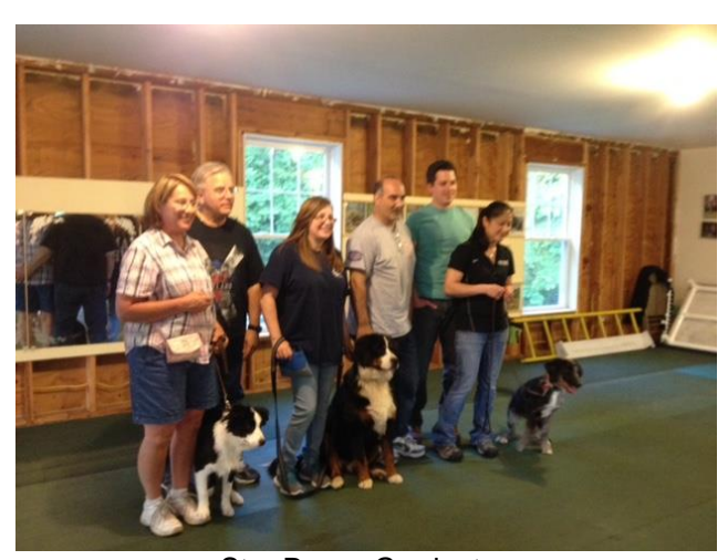
Star Puppy Graduates