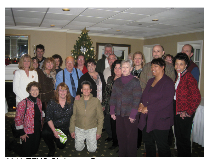
2013 TFKC Christmas Party